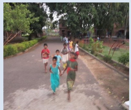
Daily morning activities of children at Chiguru