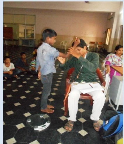
Medical tests are conducted during Eye Camp, Blood Test Camp and BMS Camp