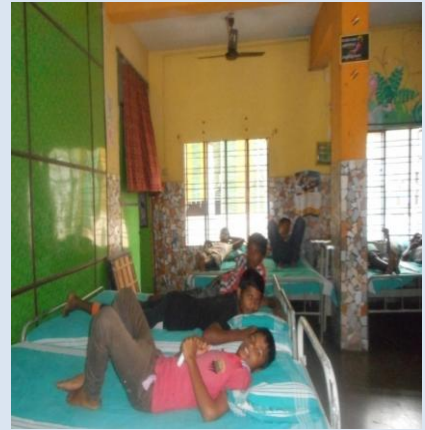
Children are taken care at by Nursing staff at Infirmary