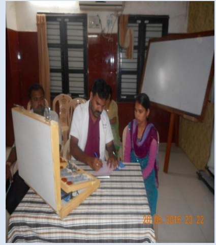
Children are treated at various hospitals for treatment.