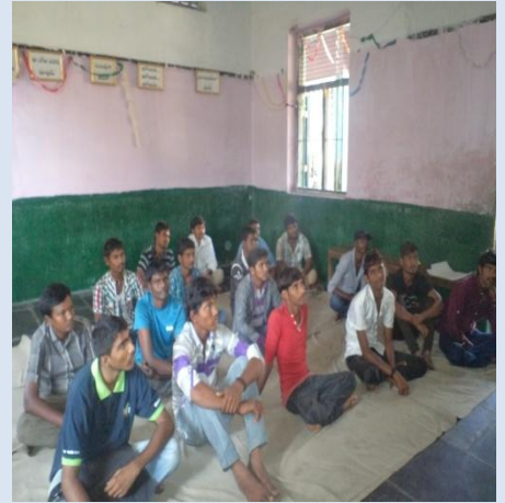
Life Skills Education (LSE) classes for youth boys at Night Shelter