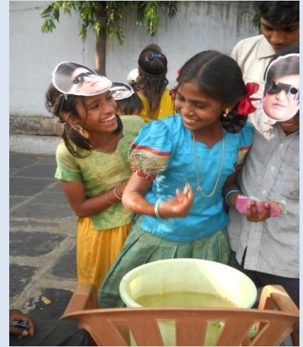
Children participation in Monthly children Mela being held at Shelter