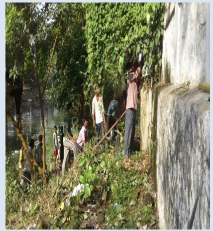
As a social responsibility, all children from 3 trades in VTC joined their hands in Swachh Bharath Ceaning Progamme at Shelter