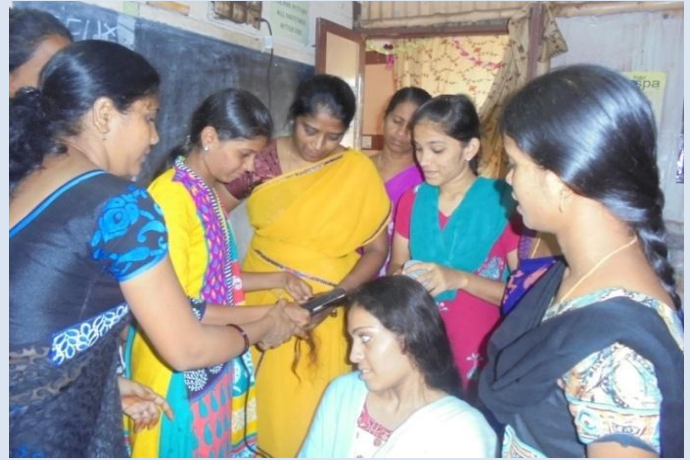
Adolescent girls/women are practicing beauty culture in their practical classes