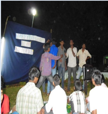
Recreation games and competitions