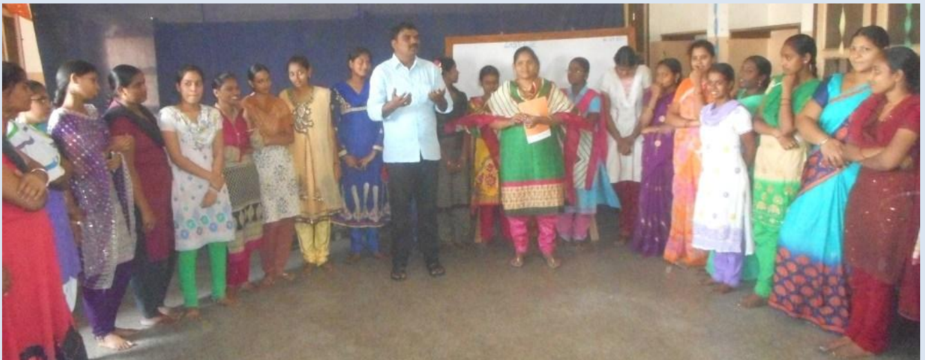
Life Skills Education (LSE) classes for VOCATIONAL TRAINEES at BVK Centre, Auto Nagar