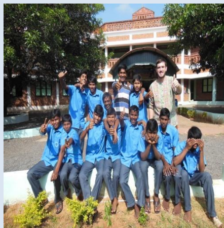
Children's Unity at Vimukthi