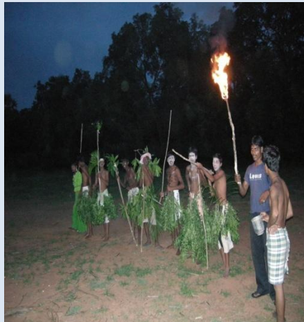
for Vimukthi children