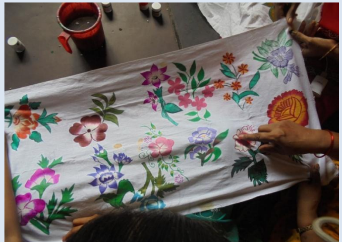
Adolescent girls/women are learning Fabric Printing/Fabric Designing methods in Fabric Printing course