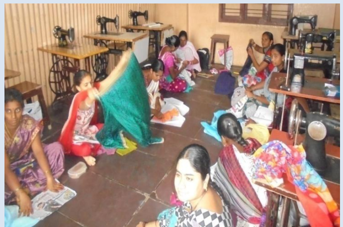
Adolescent girls/women are learning Cloth cutting tips and Stitching tips in Tailoring courses