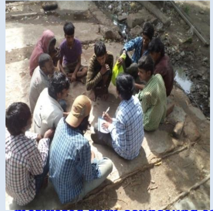
motivated thru counseling and