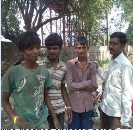
The rescued children being sent to Vimukthi Camp for de-addiction and lead a better life