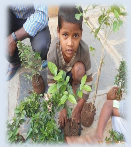
Children along with staff participated in Swachh Bharat (Clean India) programme