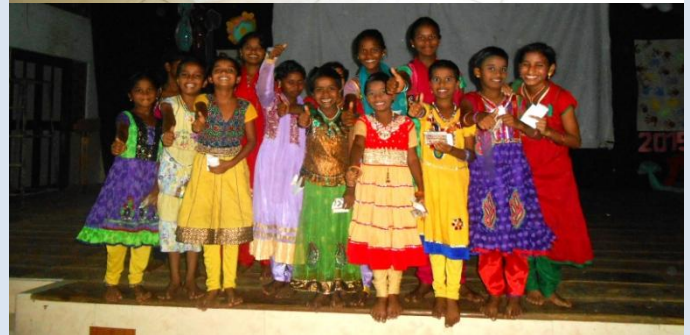
Counselling follow up the children

Mainstreamed children into regular schooling as on March 31, 2016.